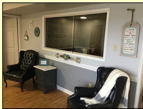
Another view of the new Entry Foyer