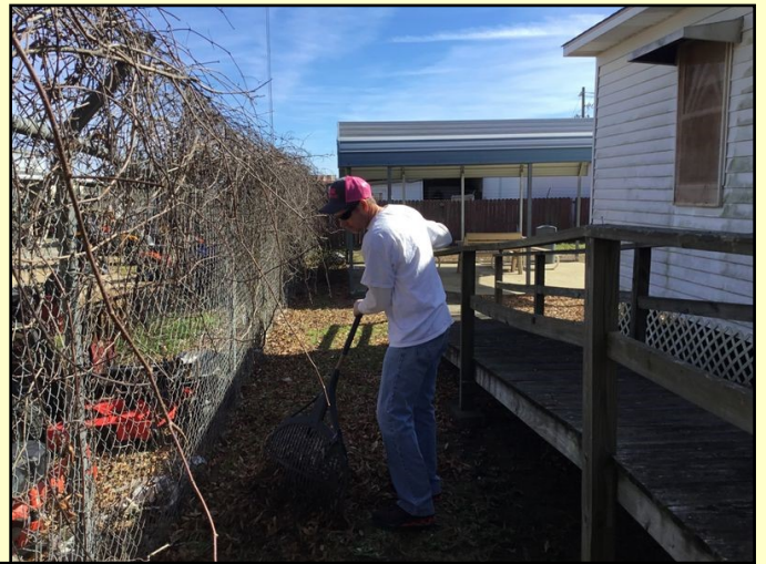
More Volunteers hard at work cleaning the property at our first work day

Again, we are so grateful for the 16 volunteers that helped us on our first work day. Will you consider coming to our March 3rd workday? Many Hands Make Light Work! Hope to see you then.