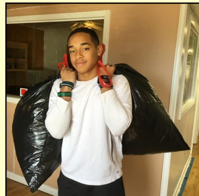
Cleaning up the debris inside

This was the start of our momentum. Shortly after the first clean up day we met with Bryan Upshaw, of Upshaw Construction, about the needed remodeling work. Due to the recent rain days that would not allow his crew to work outside, they were able to begin demolition work and repairs at the Day Center sooner than expected.