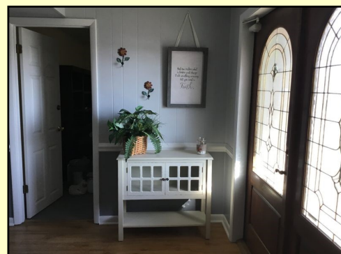
Another view of the completed Entry Foyer

Could you, your business, civic or church group provide one of these items? Let us know what you can donate.