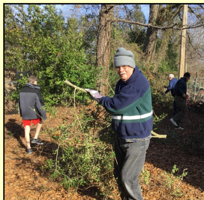
Cleaning up limbs and leaves on the property

We have so much to share, where do we begin? Let's begin with a BIG THANK YOU to the 16 volunteers that came out Saturday, February 3rd, to help prepare our new Day Center for further renovations.