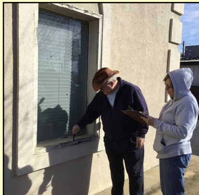
Inspection of property and list made of needed repairs