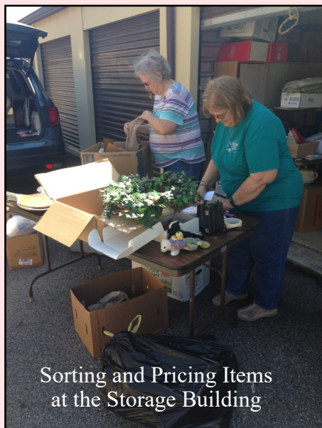
Sorting and Pricing Items at the Storage Building