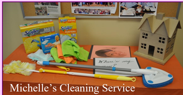
Michelle's Cleaning Service