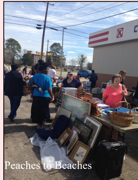
Peaches to Beaches