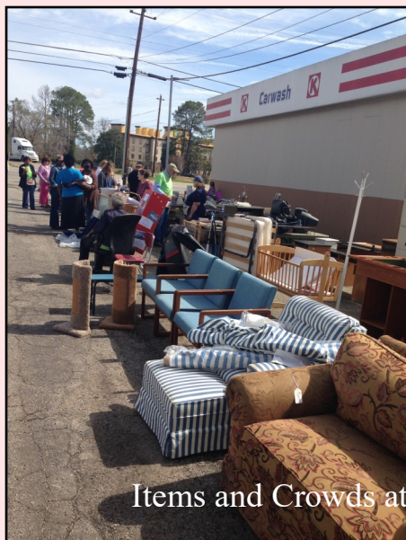
Items and Crowds at