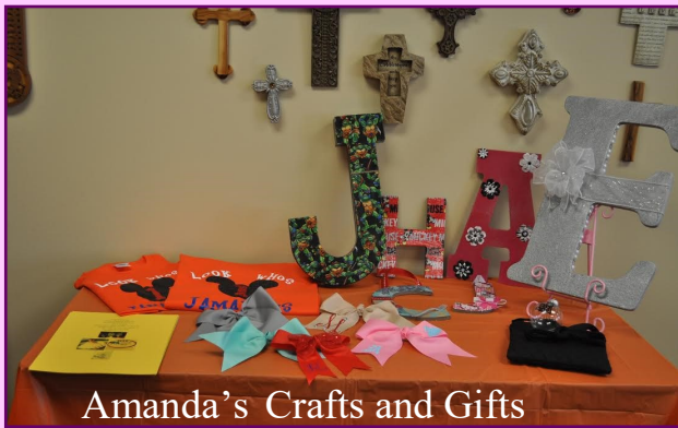
Amanda's Crafts and Gifts