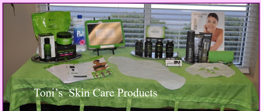
Toni's Skin Care Products

If you would like to contact any of these ladies to use their services contact the Day Center at nrosser.familypromisega@gmail.com