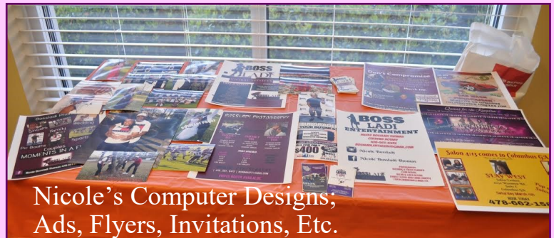
Nicole's Computer Designs; Ads, Flyers, Invitations, Etc.