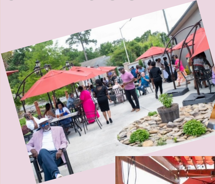
A Capacity Crowd

Thank You to everyone who joined us for our special edition of JAZZ in the CITY! It was wonderful to have so many of our friends help us celebrate 10 years of service in Houston County.