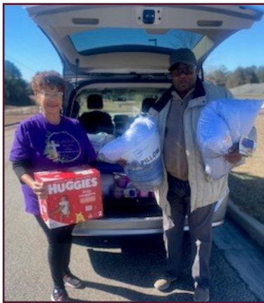
Piney Grove Baptist Church, Kathleen, donated Diapers, Pillows, and other supplies to Family Promise. God Bless You for your thoughtfulness!