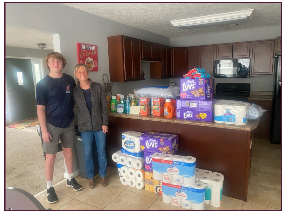
Donation of needed supplies from Harvest Church. Thank You from the bottom of our hearts! You are a blessing!

Mops Toilet Paper Trash Bags - Tall Kitchen Trash Bags - 35 gallon