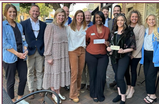
Perry Kiwanis Club and Zaltana Club donated the proceeds from the "Pancake Breakfast with Santa" Event to FPGHC. We are so grateful for this generous donation!