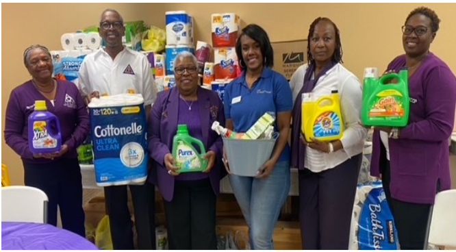
The Civic organization, Ladies of the Circle of Perfection, blessed us with many needed supplies for our families. Thank you for your support of Family Promise!