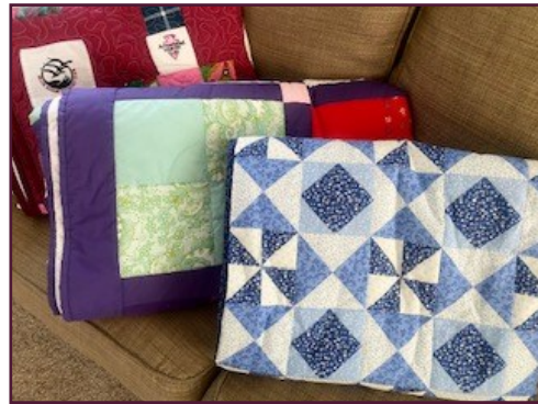
The Warner Robins Senior Center made and donated Quilts to our guest families. Such a wonderful gift for this time of year! Thank You for our kindness.